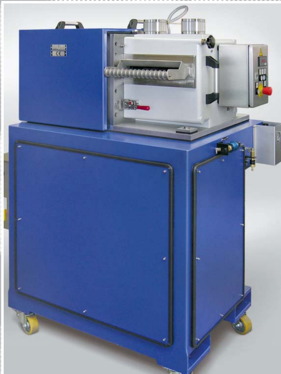
Strand Pelletizer SGS 300-E4