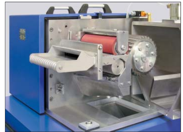
Complete and free accessibility by unilateral support of the pelletizing unit.