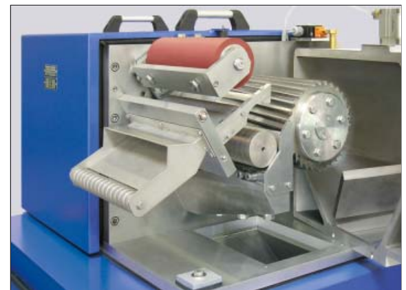
The upper feed roll and the strand infeed chute are simply elevated to enable much faster cleaning.